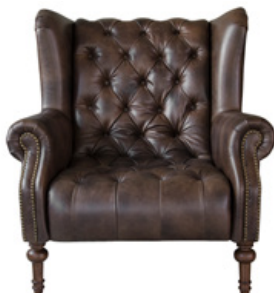
SHOWN IN CAL VINTAGE