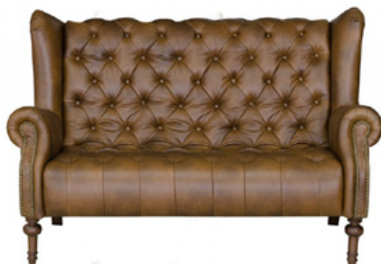
SHOWN IN CAL TAN

Our new Theo sofa is the perfect accompaniment to a tea for two. Invite a friend with our grand high backed chair and lounge in style. Available in a variety of fabrics and leathers.