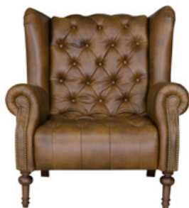
SHOWN IN CAL TAN