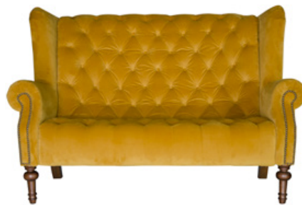
SHOWN IN PLUSH TURMERIC