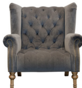
SHOWN IN PLUSH ASPHALT