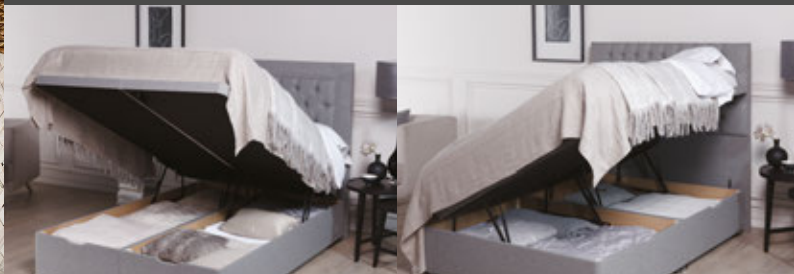
End Lift Option