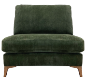
W- 78cm H- 87cm D- 103cm