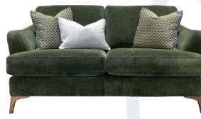
W- 170cm H- 87cm D- 103cm