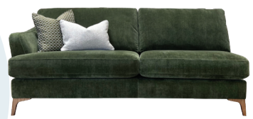
W- 202cm H- 87cm D- 103cm