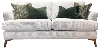
W- 196cm H- 87cm D- 103cm