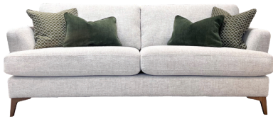
W- 220 cm H- 87cm D- 103cm