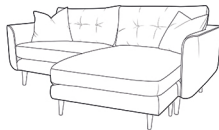
Large Chaise Sofa (interchangeable left/right hand facing) H87 x W215 x D152cm