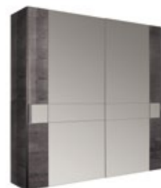
2/D SLIDING WARDROBE

Inner size inch 71" x 80" - cm 180,5 x 200,5 inch W 84" D 85" H 49" cm L 213 P 215,3 H 123,8 Crts 3 kg 102 m 3 0,36