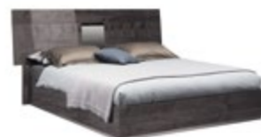
Q.S./UK 5" BED PJHE0150

inch W 64" D 18" H 18" cm L 162 P 45 H 45 Crts 1 kg 40 m 3 0,44