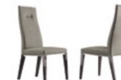
2 CHAIRS KJHE620 2 CHAIRS (UK FIRE RETARDANT) KJHE6201

inch W 52" D 1" H 38" cm L 132 P 2,2 H 96 Crts 1 kg 26 m 3 0,14