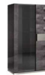
2/D CURIO PJHE600 With glass doors

inch W 25" D 21" H 75" cm L 64,5 P 52,7 H 190,4 Crts 2 kg 98 m 3 0,83