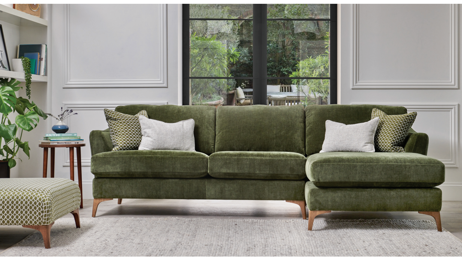
Image shows Left Hand Facing 2.5 seater with a Right Hand Facing Chaise in Manhattan Conifer with Smoke wood feet