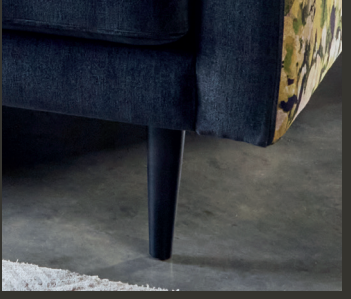
Metal Plinth Option