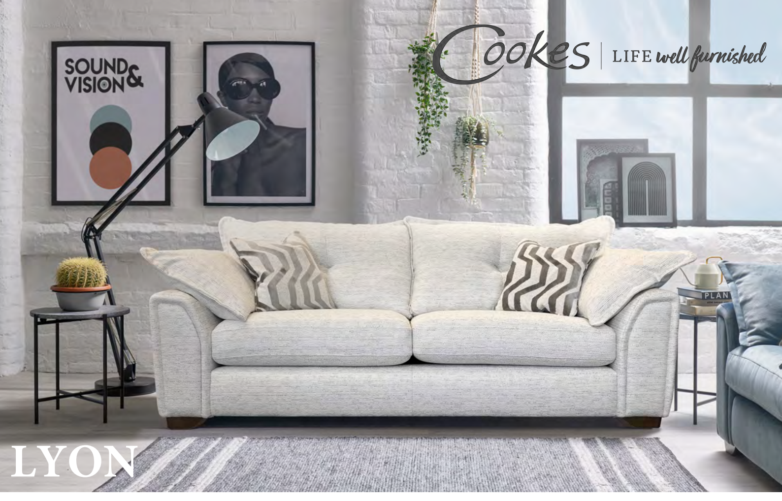
Image shows 3 Seater sofa in Avana Cream and Cuddler in Manolo Atlantic with Smoke feet with Radoma Stone accent scatters.