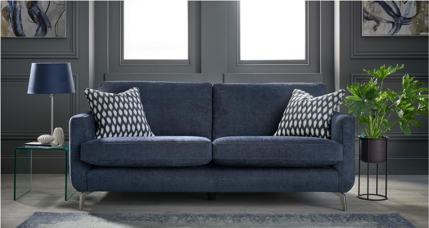
Image shows 3 Seater Sloane in Harlow Sonic with Ditto Marine Scatters and Brushed Chrome feet