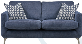
2 Seater Sofa