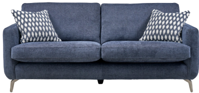
3 Seater Sofa