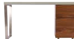
OFFICE DESK PT13 H75cm W140cm D65cm