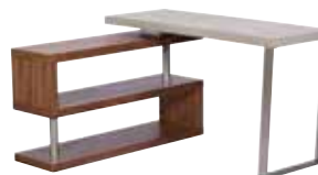
CORNER DESK PT23 H76cm W135cm D50cm