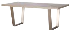
160CM DINING TABLE PT06 H75cm W160cm D90cm Measurement between legs 128cm