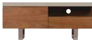
TV UNIT PT05 H50cm W120cm D45cm