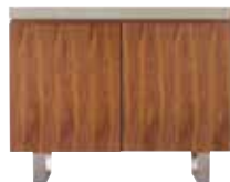
NARROW SIDEBOARD PT11 H80cm W100cm D42cm