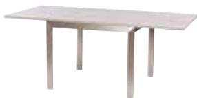
90CM-180CM FLIP-TOP DINING TABLE PT07 H75cm W90cm D90cm Measurement between legs 88cm