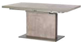
160CM EXTENDING DINING TABLE PT17 H76cm W106cm-220cm D90cm