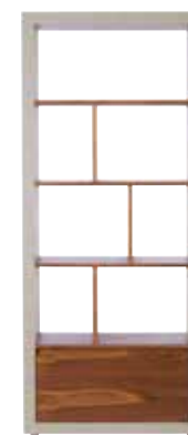
TALL BOOKCASE PT12 H190cm W80cm D39cm