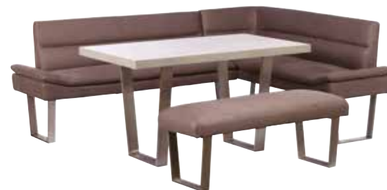
CORNER SOFA (LEFT OR RIGHT) PT08 H84cm W228cm D178cm