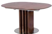
140CM EXTENDING DINING TABLE PT19 H75cm W140cm-180cm D110cm