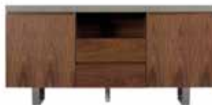
DISPLAY WIDE SIDEBOARD PT15 H80cm W165cm D45cm