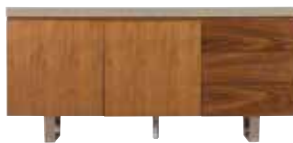
WIDE SIDEBOARD PT02 H75cm W160cm D45cm