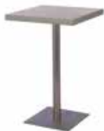
BAR TABLE PT14 H110cm W70cm D70cm