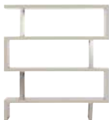
BOOKCASE PT18 H132cm W120cm D40cm