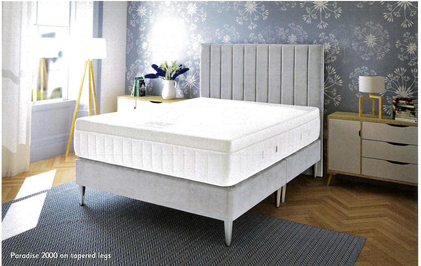
Paradise 2000 on tapered legs