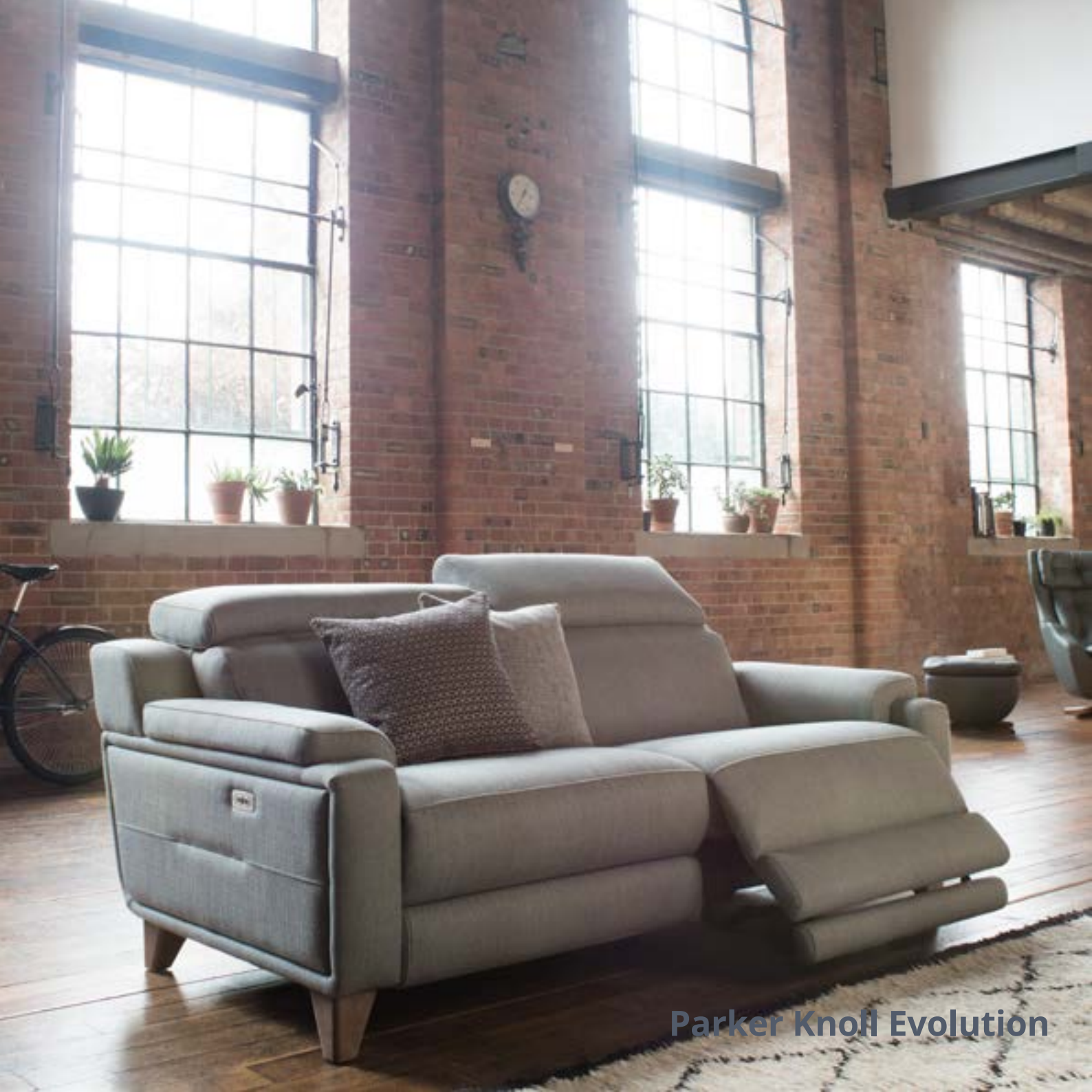
Parker Knoll Evolution