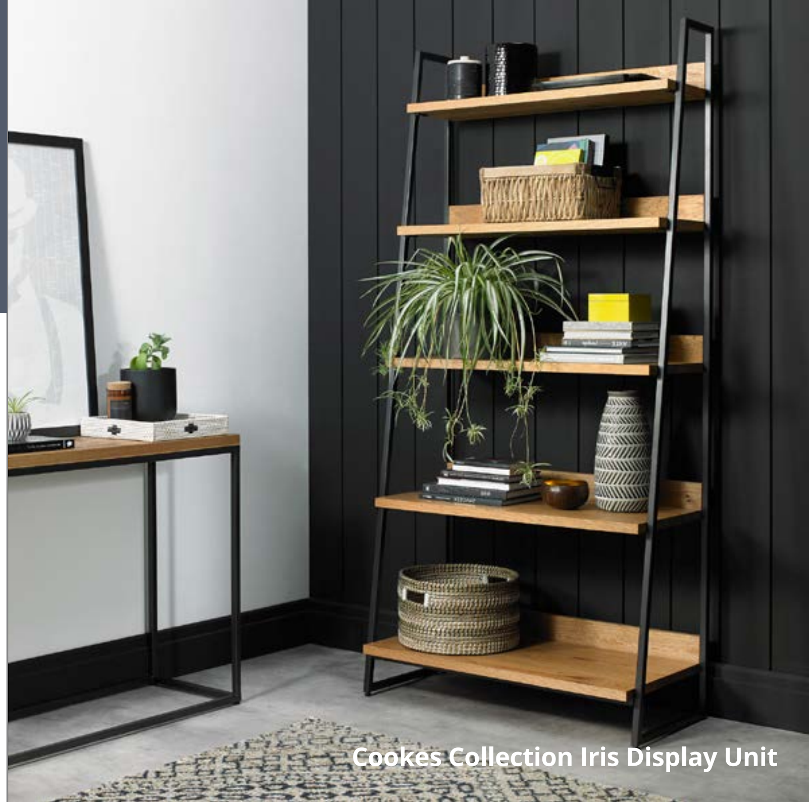
Cokes Collection Iris Display Unit

If you love the look of your home and aren't planning any major redecoration then you can achieve an industrial vibe with a few key pieces of furniture. Perhaps a concrete-top coffee table, a parquet top dining table or a statement bookcase with matt black metal and chunky oak shelving?