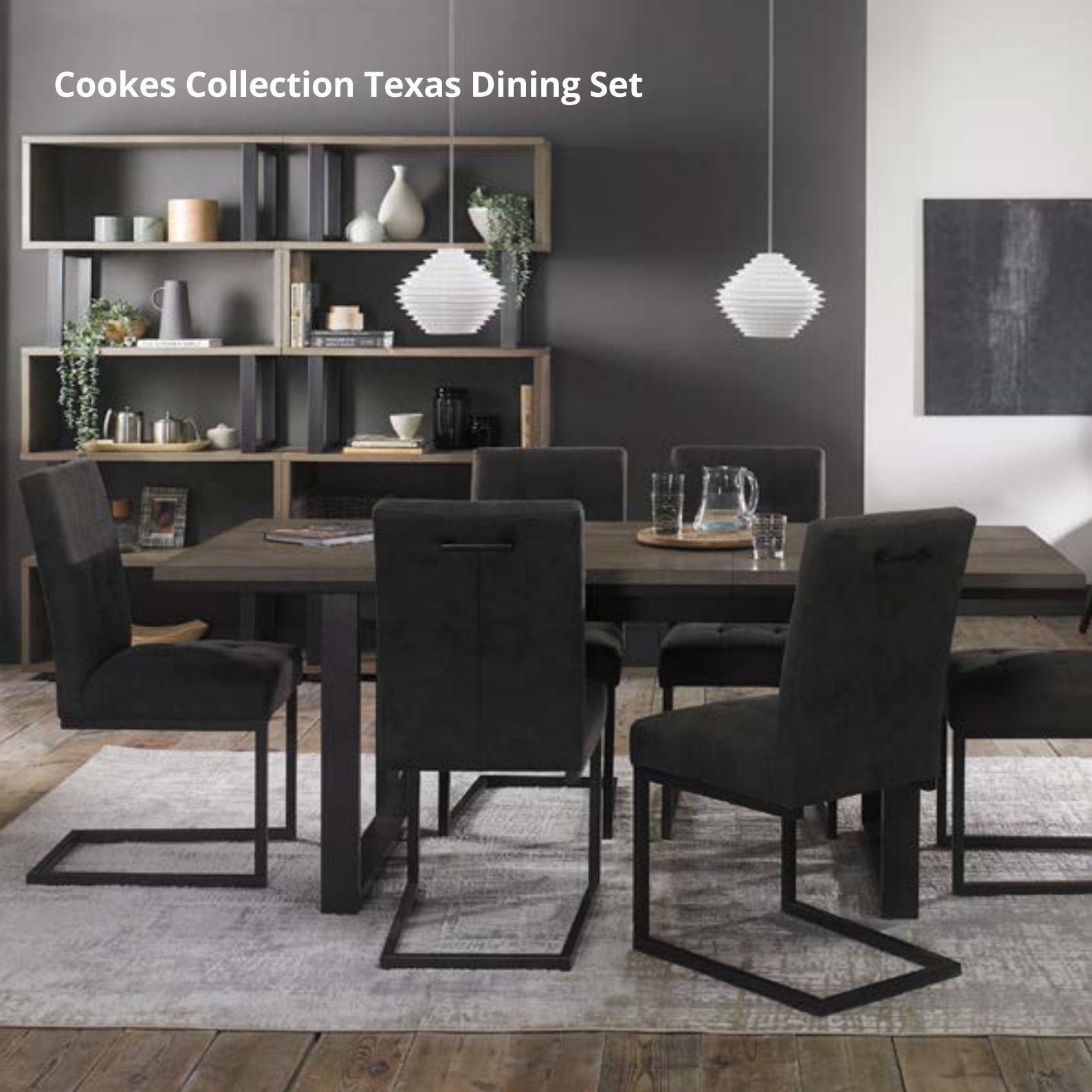
Cookes Collection Texas Dining Set