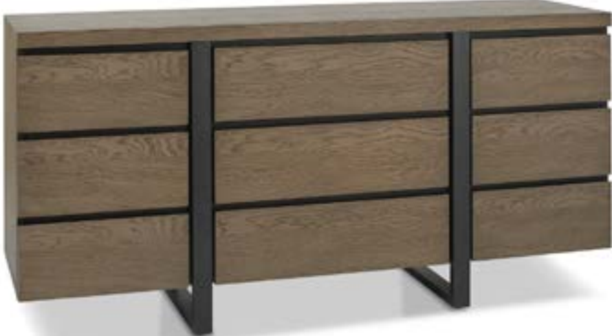
Cookes Collection Texas Sideboard