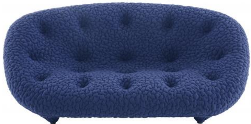
SMALL SETTEE LOW BACK