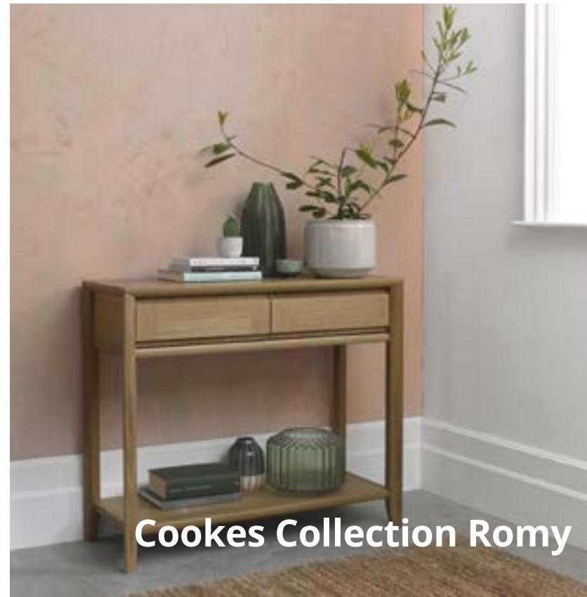
Cookes Collection Romy