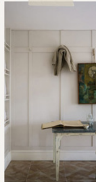
'School House White'

We love this high-energy, yet very liveable palette, which can be used to varying degrees and intensity around the home. From children's bedrooms, to dining rooms to kitchens this palette can be a wonderful starting point for a redecoration project.