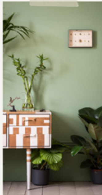
'Breakfast Room Green',