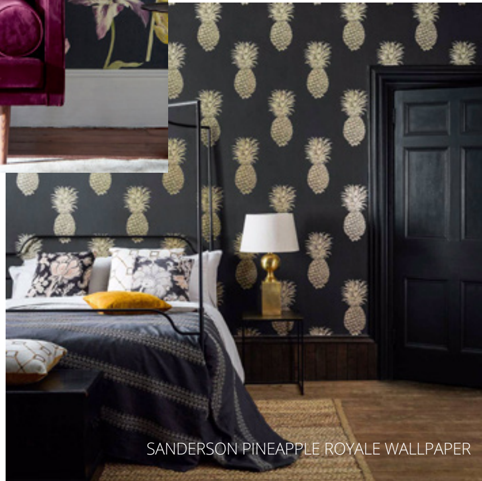
SANDERSON PINEAPPLE ROYALE WALLPAPER