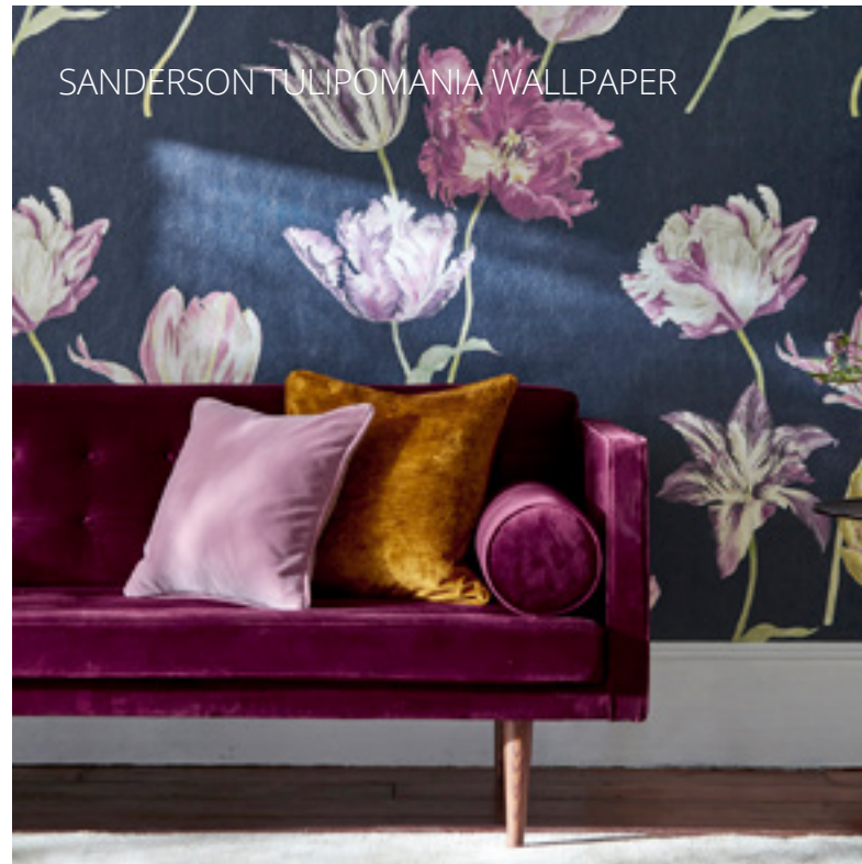
SANDERSON TULIPOMANIA WALLPAPER